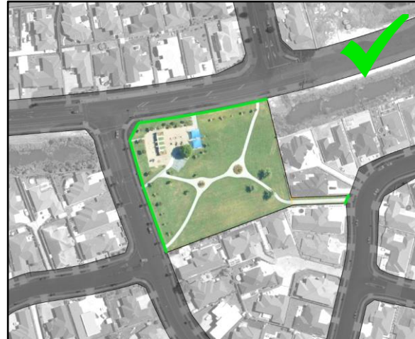
This example demonstrates excellent road frontage, and internal and external connectivity.