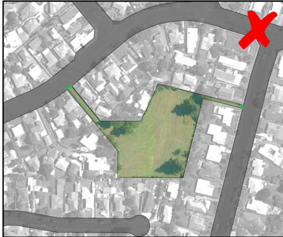
Poor outcome with poor road frontage, zero passive surveillance from public space, and limited narrow entrance points.